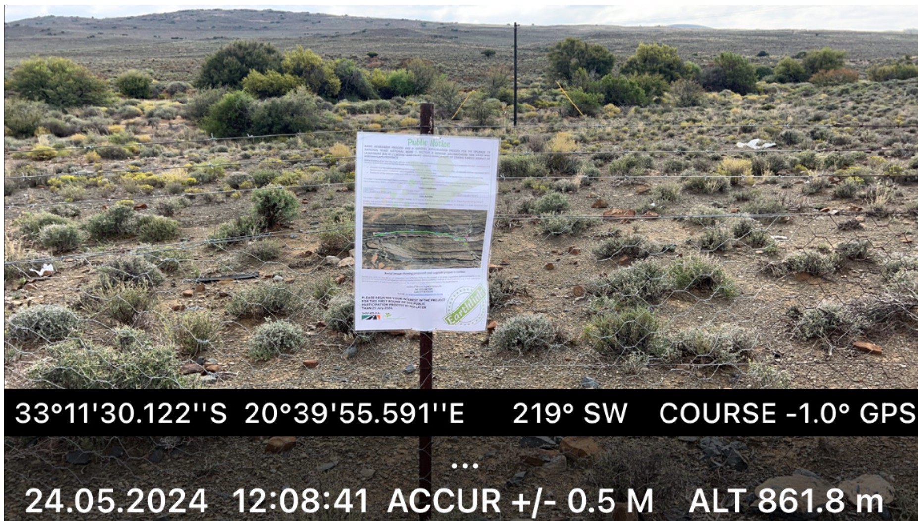
Site Notice 8 Plugged Doornfontein start point of the project