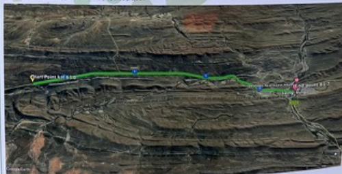
Aerial image showing proposed road upgrade project in context

SANRAL has appointed Earthlink Environmental Services as independent Environmental Consultants, to undertake the Basic Assessment and Water Use Authorization Application for the proposed project.