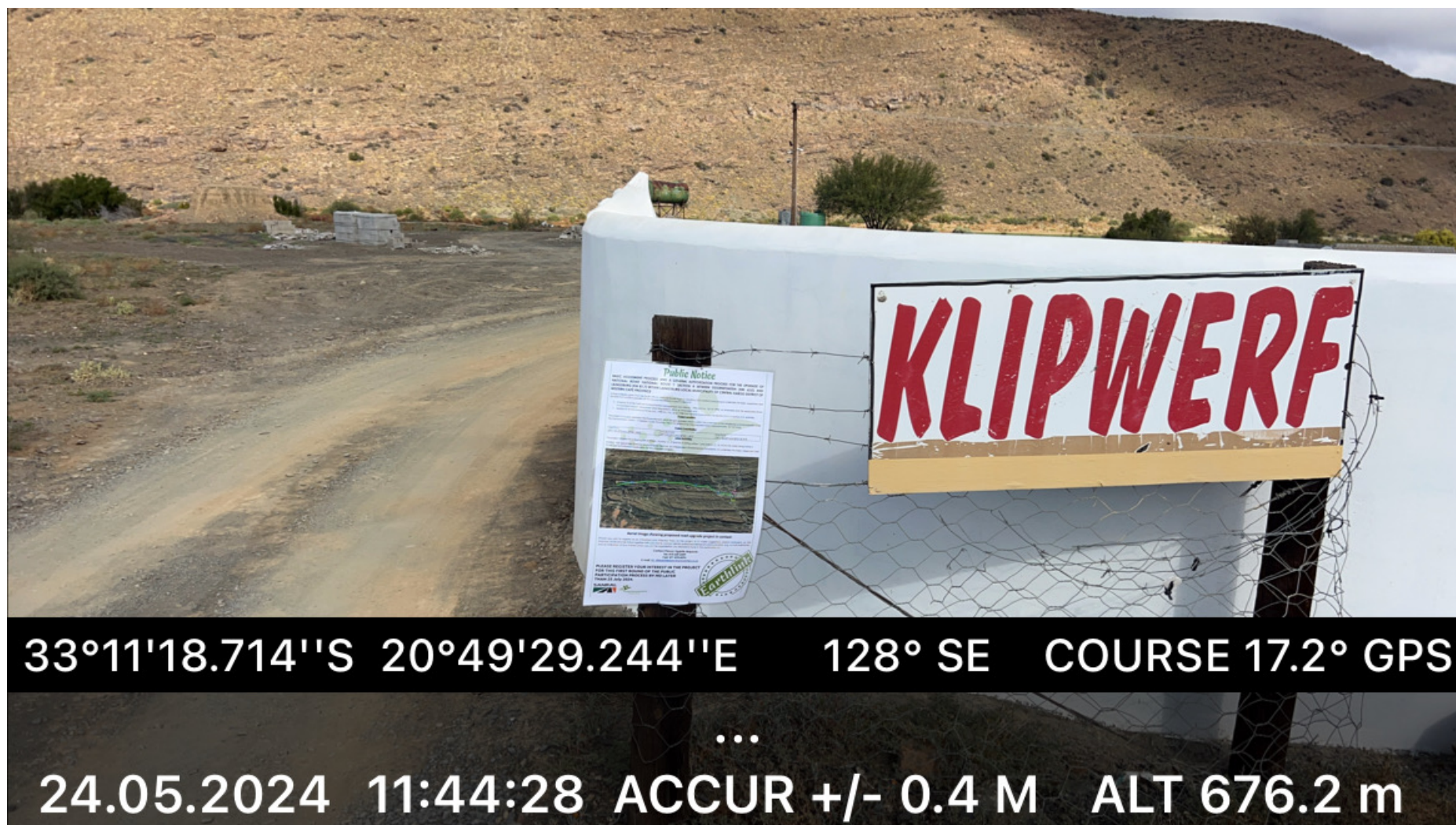
Site Notice 4 Plugged along the N1 at Farm house (Klipwerf)