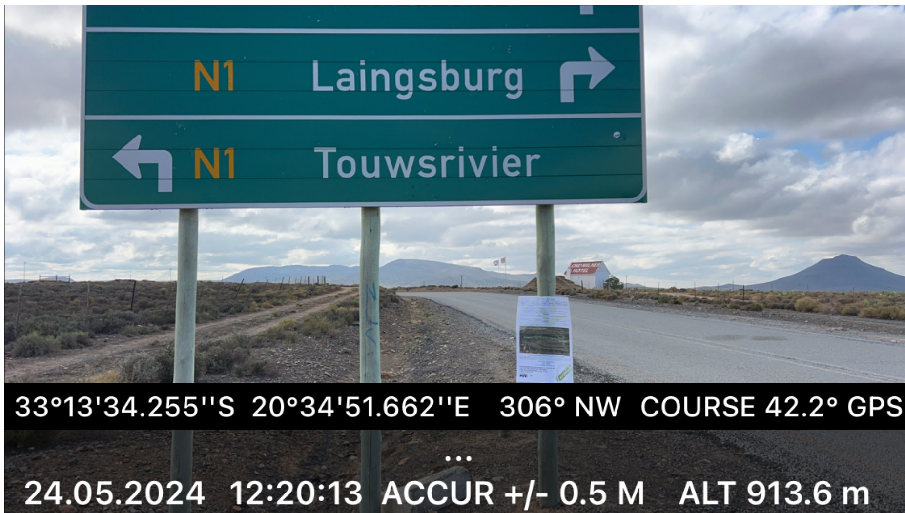
Site Notice 7 Plugged along R358 Road at Doornfontein