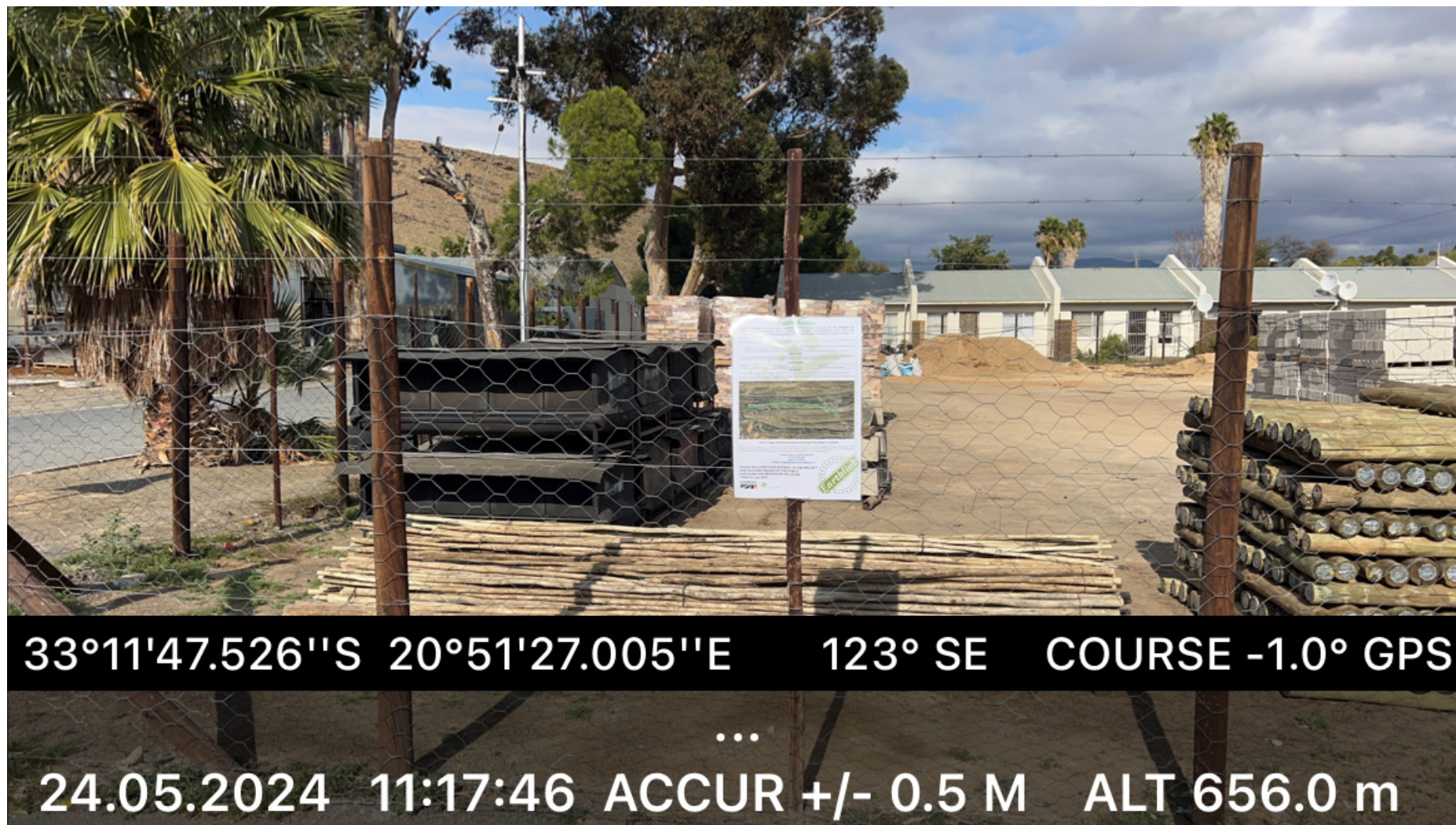
Site Notice 1: Plugged at the end point of the project (Laingsburg town)