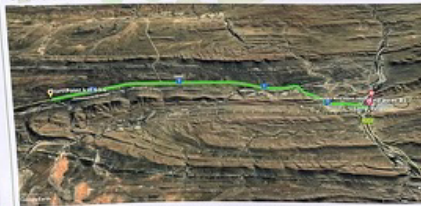
Aerial image showing proposed road upgrade project in context

The project triggers the following EIA activities: Activity 12, 14 and 16 of Listing notice 1 and Activity 12, 14, 16 and 20 under Listing notice 3. SANRAL has appointed Earthlink Environmental Services as Independent Environmental Consultants, to undertake the Basic Assessment and prepare the Authorization application for the proposed project.