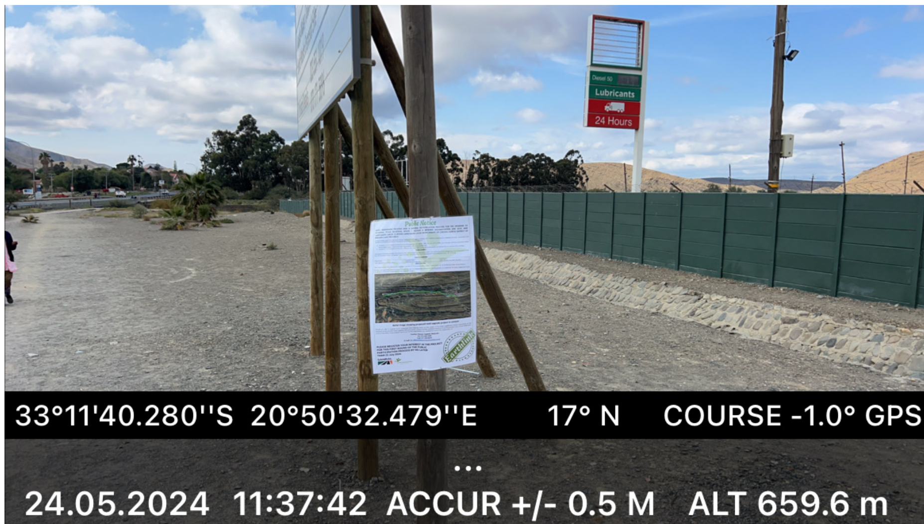
Site Notice 3 Plugged near Wilgers river bridge